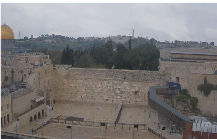
Live stream of an empty Western Wall during Pesach